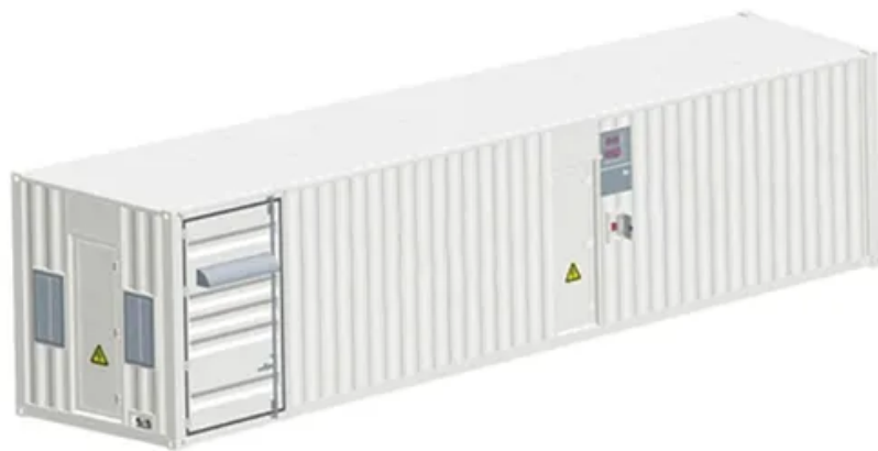
Photo voltaic solar panel companies