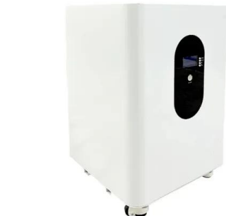
ABB central inverters PVS800 - 500 to 1000 kW

Solar inverters from ABB ABB central inverters are ideal for large PV power plants but are also suitable for large-sized power plants installed in commercial or industrial buildings. High ...